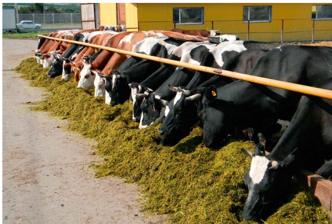
Feed time in Alpcot Agro's livestock center in Vorobievka