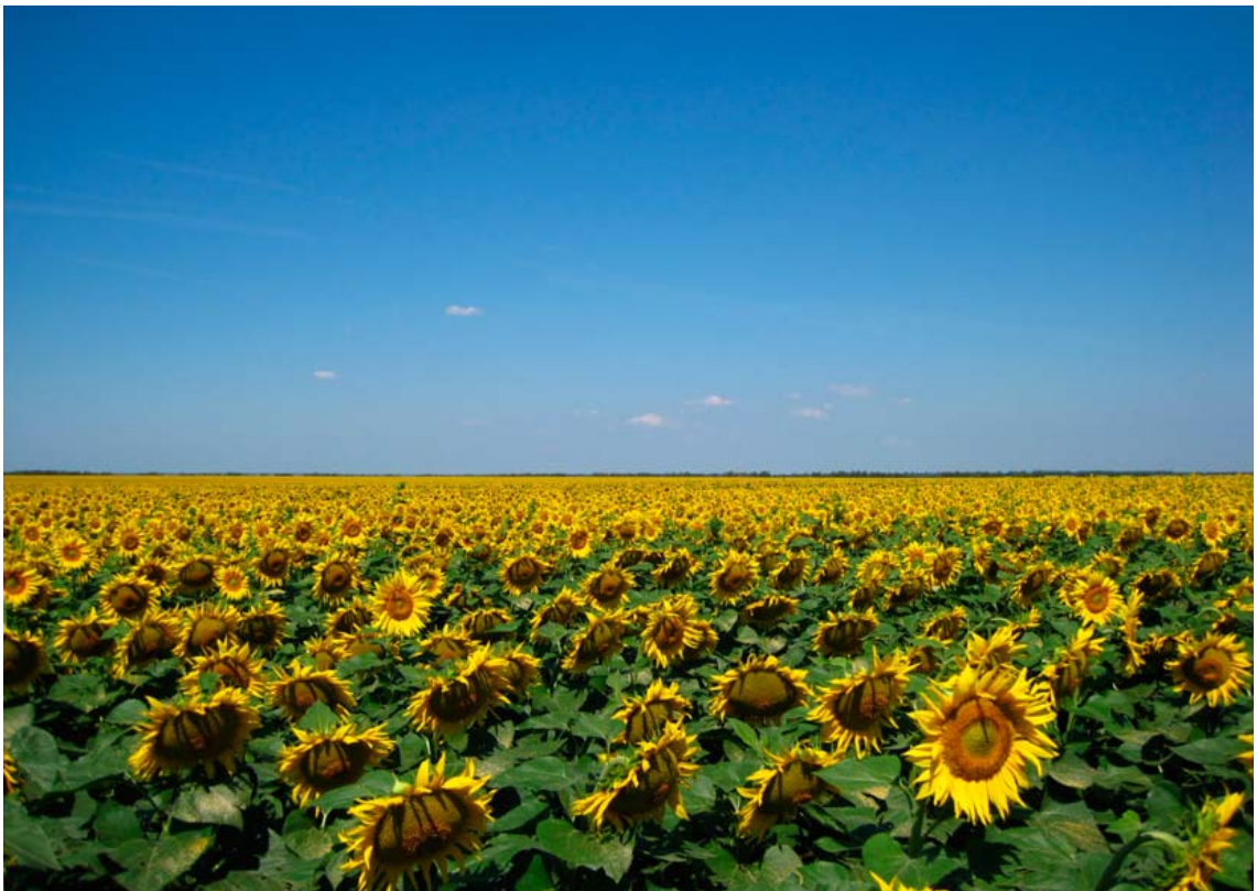
Sunflower in Ertel, Voronezh