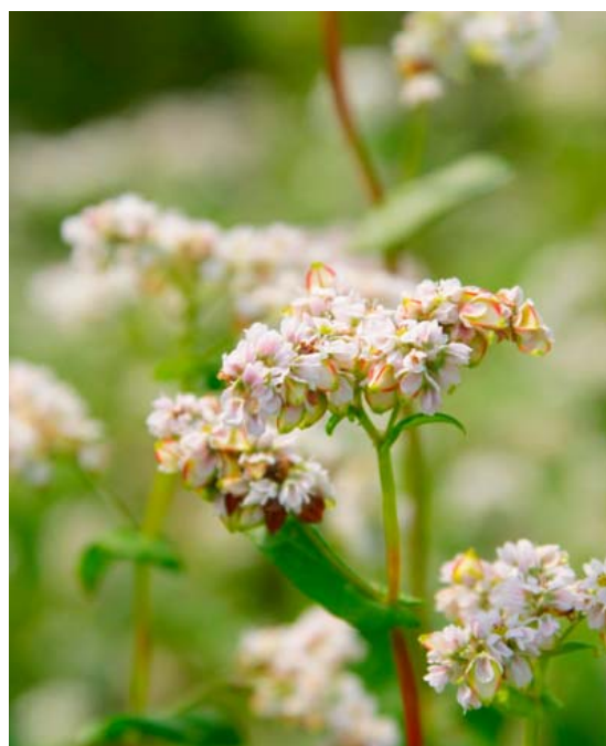
Buckwheat in Western Ukraine