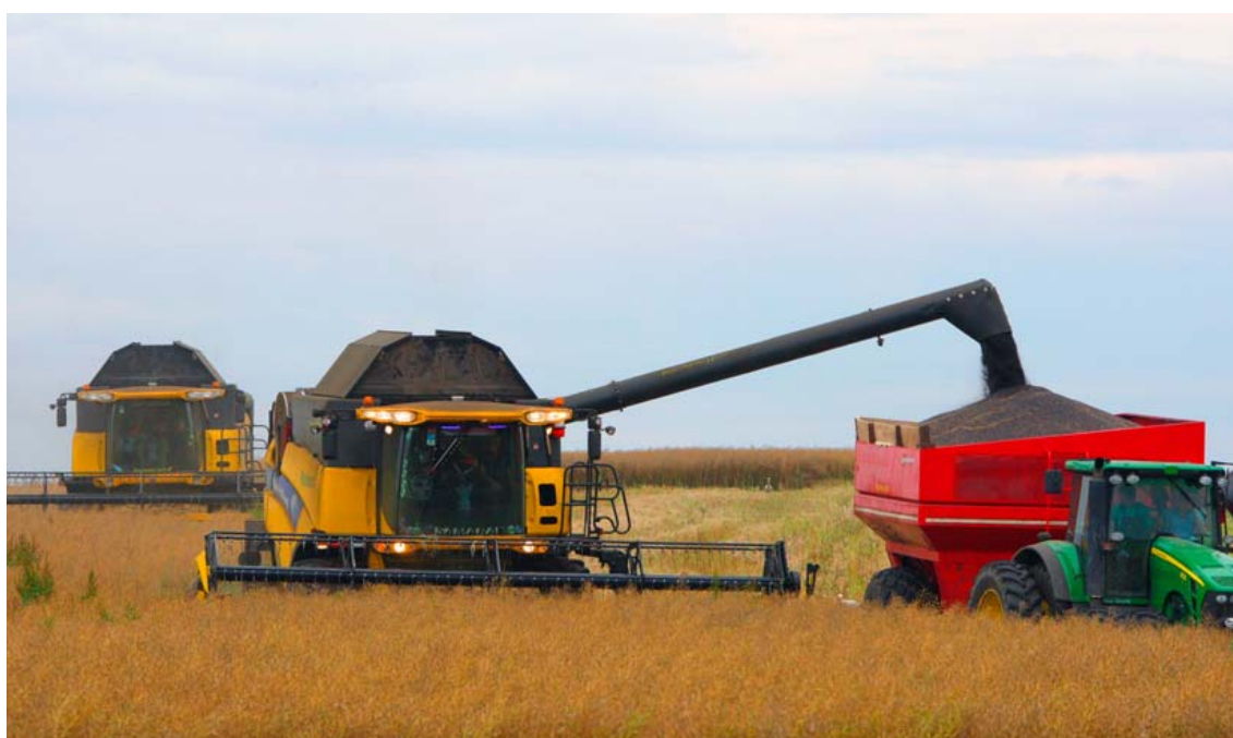
Harvesting rape in Ukraine