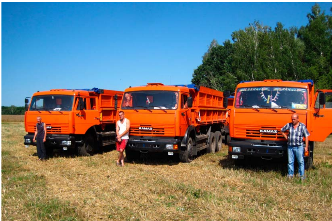
Three proud Kamaz truck drivers

In addition to the crops for sale, the Company will grow forage for the Company's livestock farms on about 6,000 hectares, and about 21,000 hectares will be cultivated as black fallow. This gives a total of 130,000 hectares in rotation. The numbers are preliminary and may change due to a number of factors, most importantly weather and price developments.