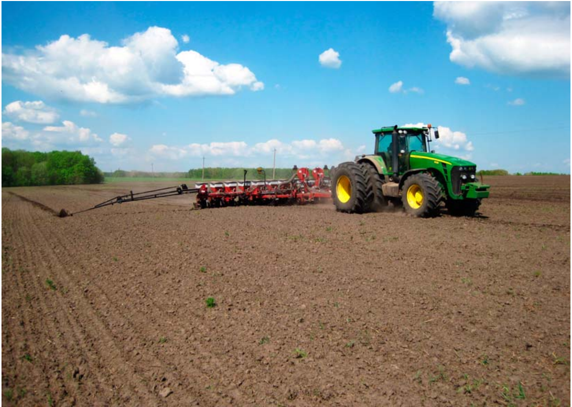
Seeding sunflower in Kursk